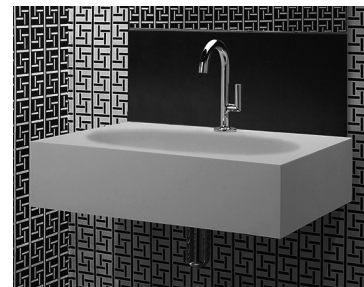
Also available as a wall-mount sink, MTCS-719D. See product specification sheet for details.